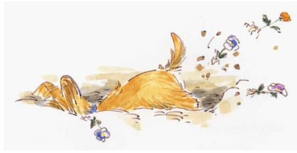
Little Dog is digging in the garden. Again!

Abbie had a little dog little dog little dog Abbie had a little dog who liked to bark at cars!